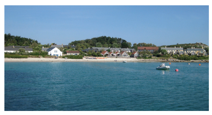
The Island Hotel, Tresco has been replaced by holiday cottages and the Ruin Beach Café.

Lines 10 & 11: When entering Old Grimsby Sound on Line Q the dangerous Little Kittern rock is abeam when Round Island Lighthouse is aligned with the northernmost dry rock of Norwethel (not the drying rocks which extend further to the NW).