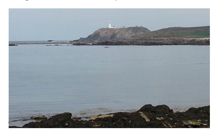
Little Kittern Rock (Oliver Crosthwaite-Eyre)